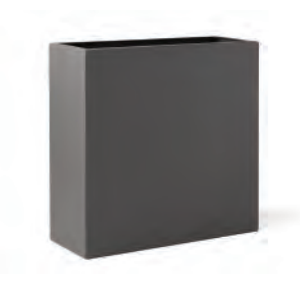
PP-DIV-32 Divider 32"L x 12"W x 32"H Pewter