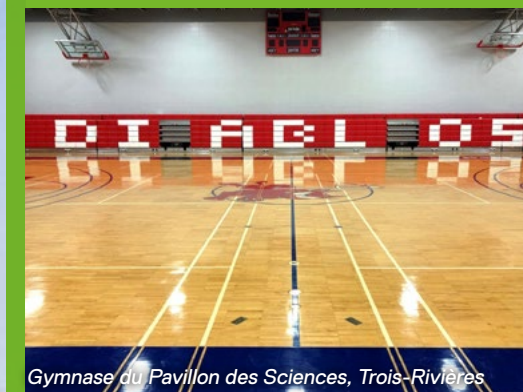
Gymnase du Pavillon des Sciences, Trois-Rivières

This new equipment uses the same biomechanics and resistance mechanisms as indoor weight machines.