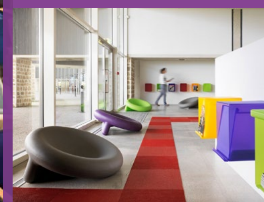
MOON by Moonako is ideal for a media library and is available in a range of colors.