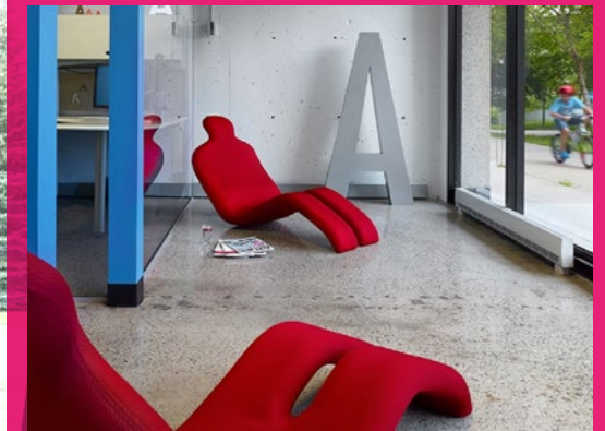
The Bouloum chair is ideal for libraries, meeting rooms or study and research centers.