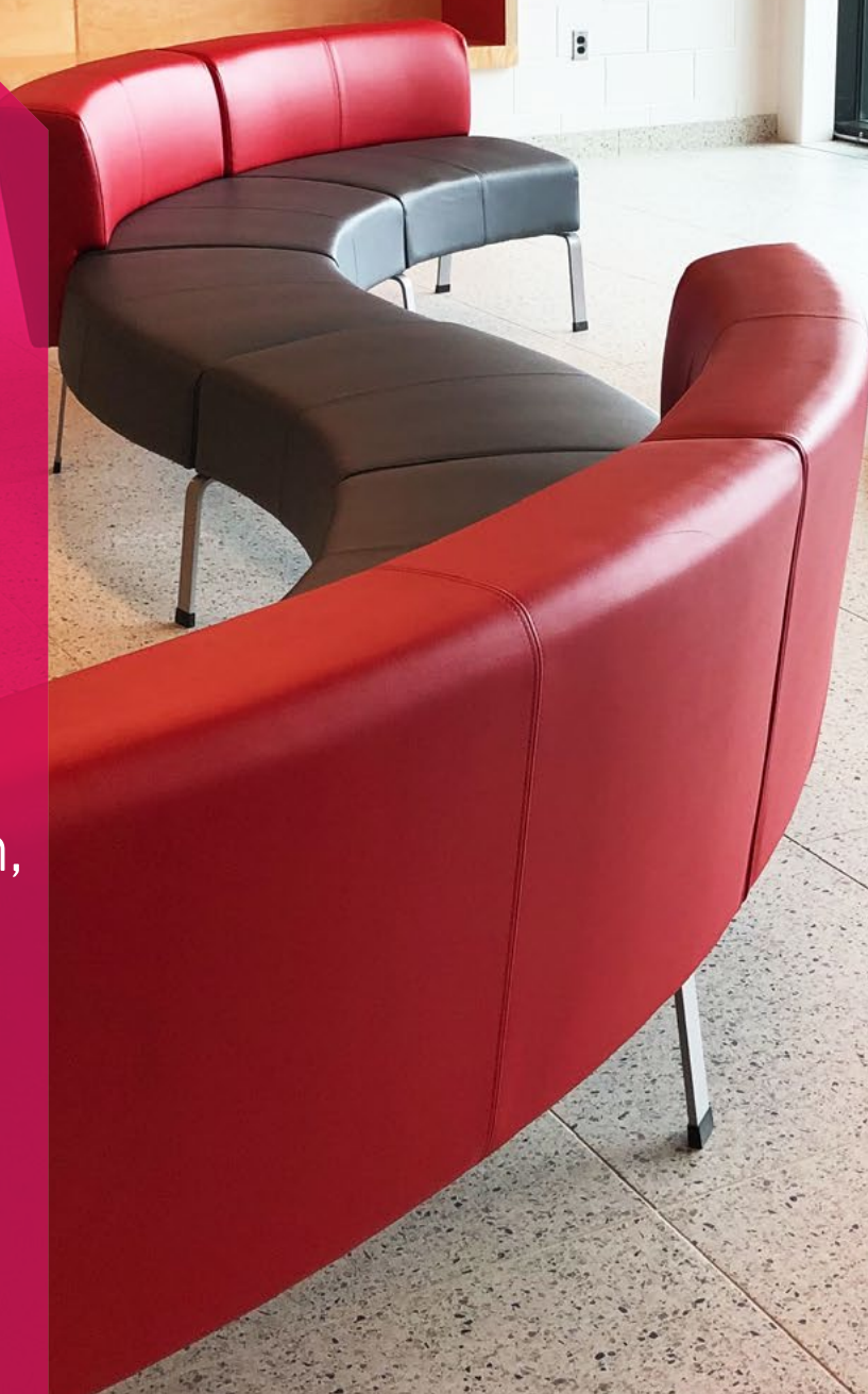
Fournier Multisport Center, Val d'Or

Atmosphäre offers interior furniture solutions for spaces that combine design, functionality and user comfort. Your waiting and relaxation areas will have everything to please your public.