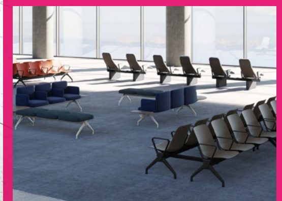
Avro by Arconas, a versatile system offering a unique, flexible solution for transforming any waiting area into a VIP lounge.