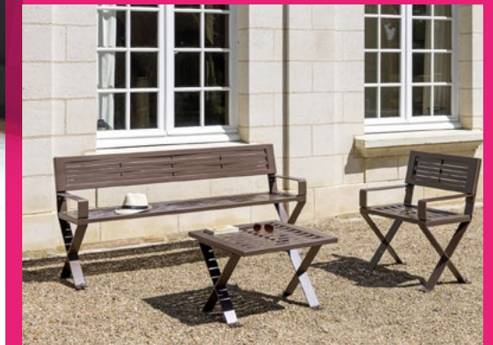
Design your terrace with style and elegance without compromising comfort and durability with the Treccia range by Concept Urbain.